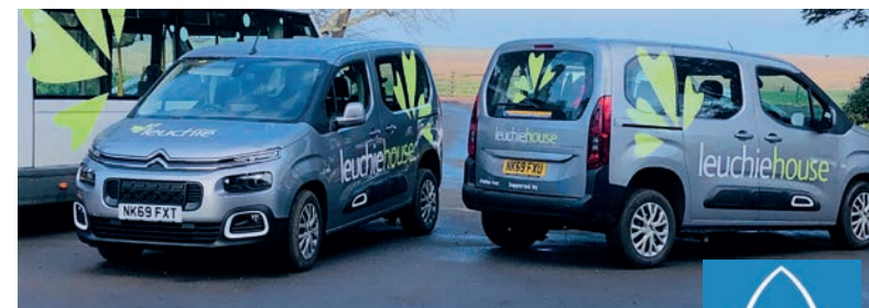
Leuchie's new wheels!