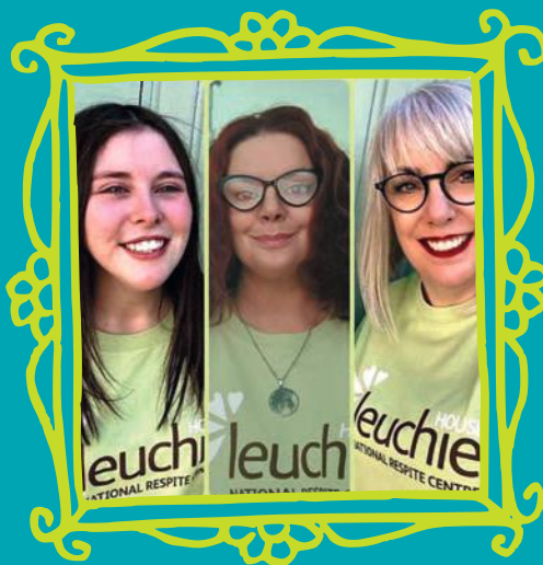
The Dancing Dobbers , danced for 12 hours in their virtual Kiltwalk challenge and raised £1065