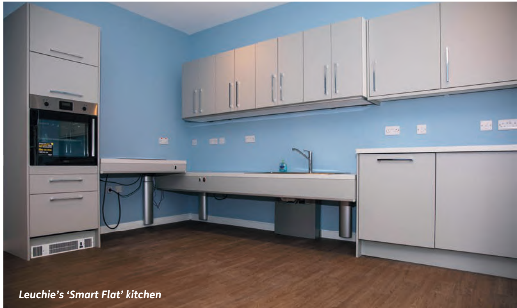
Leuchie's 'Smart Flat' kitchen