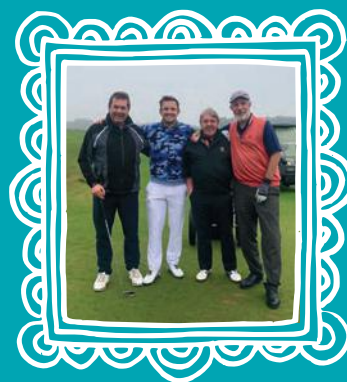
Our 2nd Gourmet Golf Day at the Renaissance Club, hosted by former Scottish International rugby player Rory Lawson, raised £30,589!