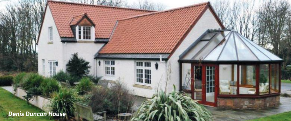
Denis Duncan House